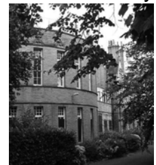
Bradford Babies Hospital

The history of the department has been intimately intertwined with that of Parkland Memorial Hospital and Children's Hospital since its inception. The first pediatric facility in Dallas was a unit called Baby Camp (1913), followed by the Presbyterian Clinic, later called the Richmond Freeman Clinic, which evolved into Children's Hospital and was located a block from Parkland Hospital, the city-county hospital for the medically indigent. Bradford Babies Hospital, a Spanish hacienda style structure, was built in 1929 a block from the Children's Hospital. Care for indigent children provided by community pediatricians and surgeons was facilitated by the propinquity of the three medical facilities and they formed the core of the clinical teaching venues. The departmental offices and research laboratories were housed in U.S. Army barracks buildings situated behind Parkland Hospital at the intersection of Maple and Oak Lawn Avenues when Southwestern Medical College was established.