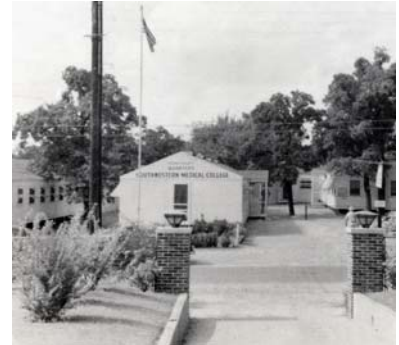
UT Southwestern Medical School - 1943