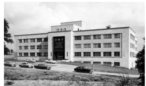
UT Southwestern Medical School - 1956