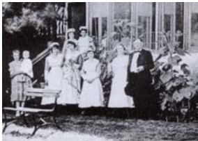
Parkland Baby Camp

The history of the department has been intimately intertwined with that of Parkland Memorial Hospital and Children's Hospital since its inception. The first pediatric facility in Dallas was a unit called Baby Camp (1913), followed by the Presbyterian Clinic, later called the Richmond Freeman Clinic, which evolved into Children's Hospital and was located a block from Parkland Hospital, the city-county hospital for the medically indigent. Bradford Babies Hospital, a Spanish hacienda style structure, was built in 1929 a block from the Children's Hospital. Care for indigent children provided by community pediatricians and surgeons was facilitated by the propinquity of the three medical facilities and they formed the core of the clinical teaching venues. The departmental offices and research laboratories were housed in U.S. Army barracks buildings situated behind Parkland Hospital at the intersection of Maple and Oak Lawn Avenues when Southwestern Medical College was established.