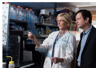
Precision Medicine p. 8