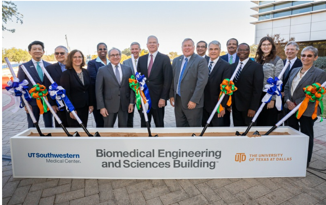
Pictured Above: UT Southwestern Medical Center and University of Texas at Dallas officials participate in the groundbreaking ceremony for the new Biomedical Engineering and Sciences building on UT Southwestern's East Campus.

A new Biomedical Engineering and Sciences Building will catalyze a unique partnership between UT Southwestern and UT Dallas to leverage the two institutions' traditional strengths in biomedical and engineering sciences and accelerate the translation of these advances into the clinic.