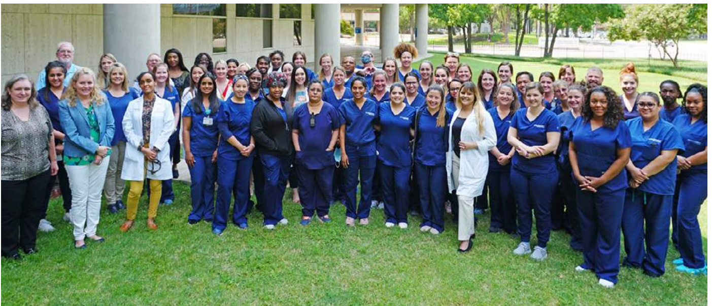
The Zale Rehabilitation Team