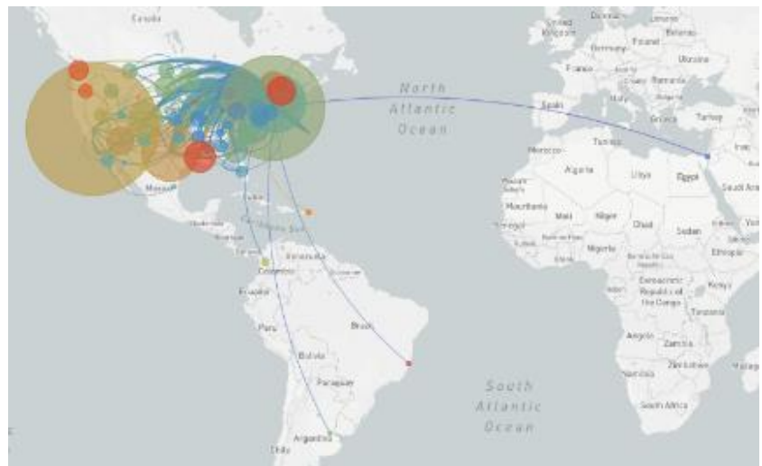
Fig. 2. Cladal spread of West Nile virus over time from the Middle East to North America and finally to South America, 1999 through April 2020.