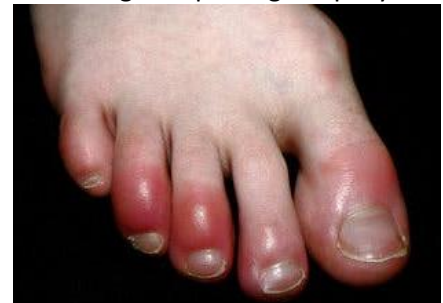
Typical example of “Covid toe” from the New York Times , May 5, 2020.