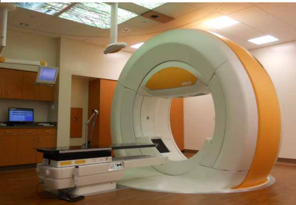
Vero radiation therapy system

Before initiating clinical service, the Vero system was thoroughly tested and commissioned by UT Southwestern faculty physicists. An evaluation of the accuracy and precision of the gantry and ring rotations yielded a maximum deviation from isocenter of 0.12 mm and 0.02 mm respectively. End-to-end studies were performed in specialized head and body phantoms. Tissue density targets imbedded in artificial lung allowed direct verification of dosimetric