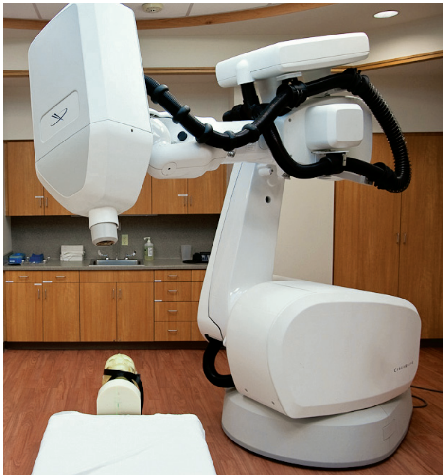
The CyberKnife system at UT Southwestern

was February 3 at UT Southwestern University Hospital—Zale Lipshy.