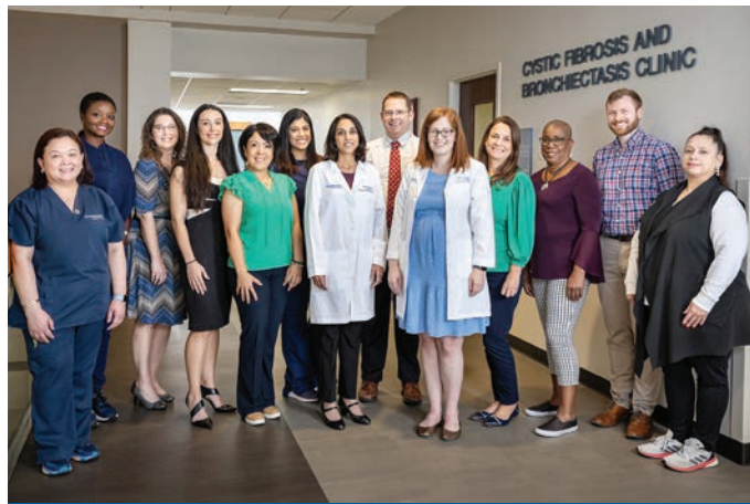
Members of the Cystic Fibrosis and Bronchiectasis Program

The CF Clinic won UT Southwestern Team Excellence Awards twice. Nationally, it received a Quality Improvement Care Award from the Cystic Fibrosis Foundation in 2018. ■