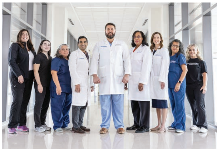
Members of the eMCAP Program