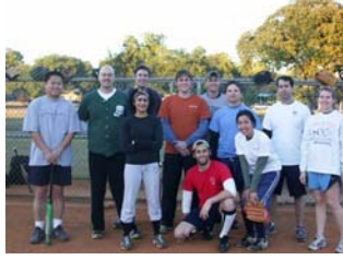
Softball B—The Nads