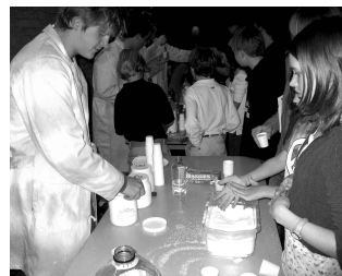
Fun making fake snow!

STARS and The Winston School extend thanks to all the presenters, participants, and students that made the event possible.