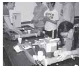
Learning how to draw blood

Check out the website for more information and pictures from past meetings: http://www.utsouthwestern.edu/stars (click on Exploring POST)