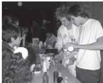
Fun With Polymers!