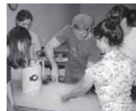
Making ice cream using liquid nitrogen!