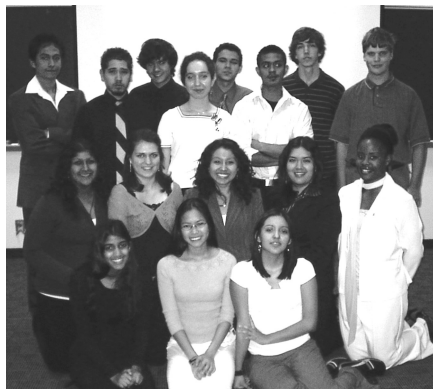
2006 Summer Research Program for Students Participants