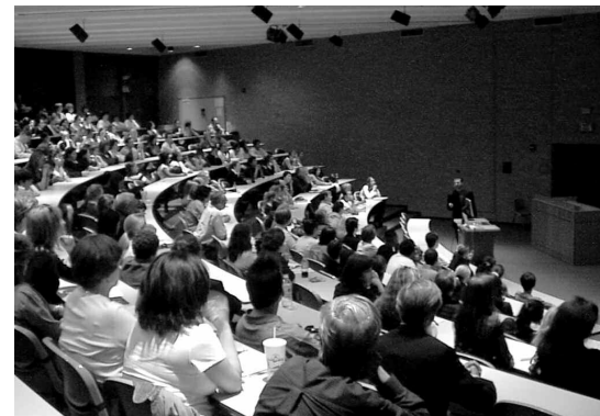
Teachers & Parents Session