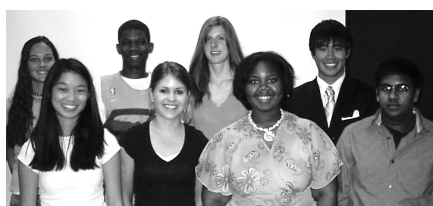
2006 Summer Research Program Associates