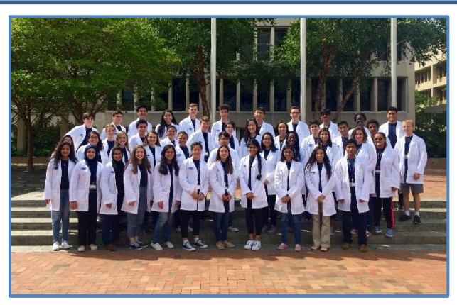
2016 STARS Summer Research Program for Students