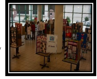
Overview of students' projects