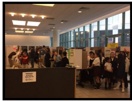
Primary students gather and wait for their projects to be judged.