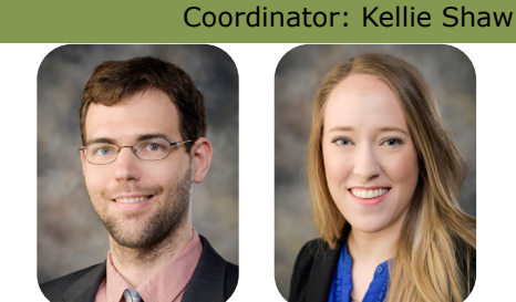
3<sup>rd</sup> Year Resident - NDD