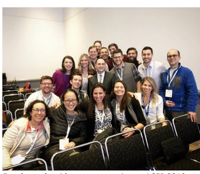
Faculty and residents representing at ACEP 2019.