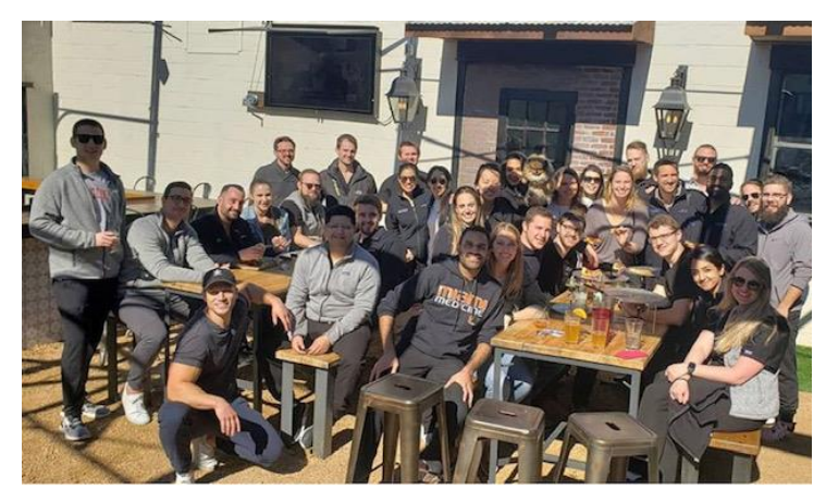
Above: Residents enjoy a local bar after the In-training examination.