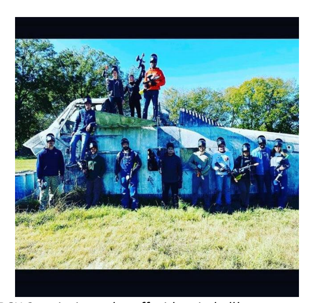
PGY-2s enjoying a day off with paintball!