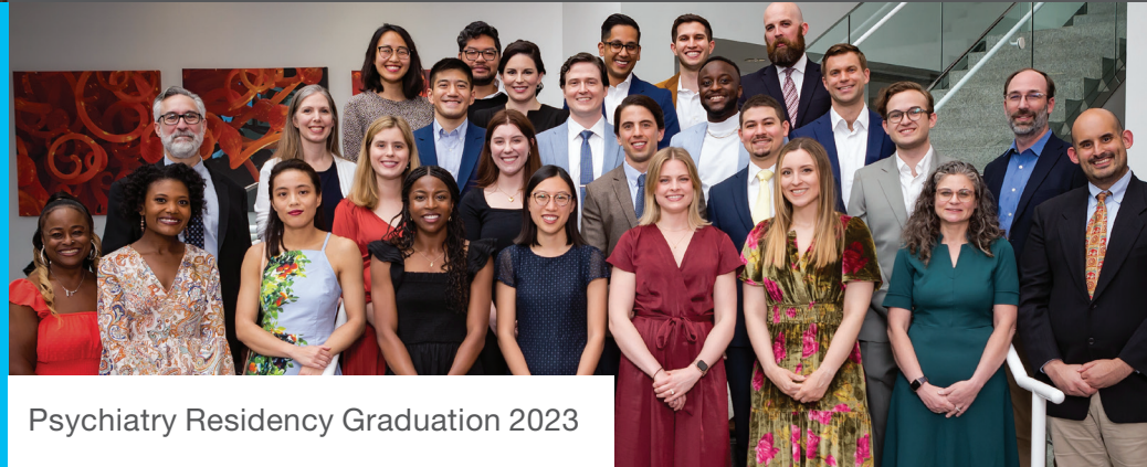
Psychiatry Residency Graduation 2023

Scan the QR code to view our latest news and newsletter archive.