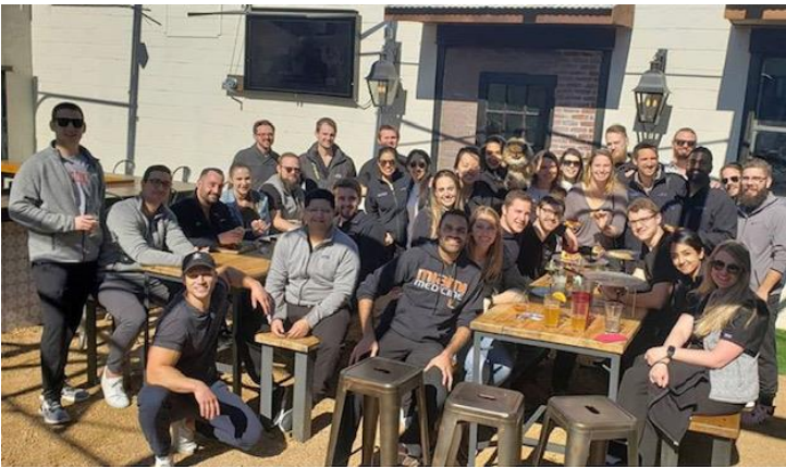
Above: Residents enjoy a local bar after the In-training examination.