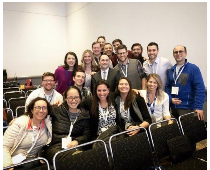
Faculty and residents representing at ACEP 2019.