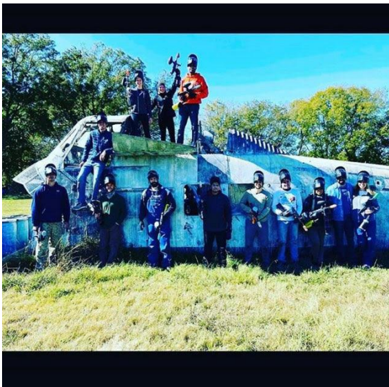
PGY-2s enjoying a day off with paintball!